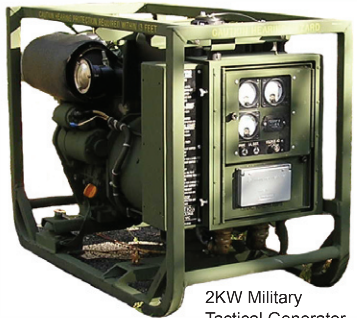
2KW Military Tactical Generator