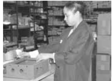
Control box assembly

Reference is made to Management's Discussion and Analysis of Financial Condition and Results of Operations for additional information regarding this segment.