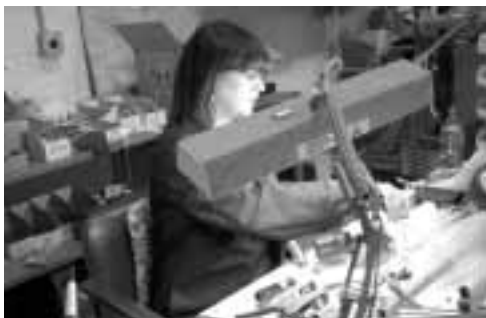
Power supply sub-assembly for indicator transmitter

Since substantially all of the Company's electronics business is derived from contracts with various agencies of the United States Government (the "Government") or subcontracts with prime Government contractors, the loss of substantial Government business would have a material adverse effect on the business.