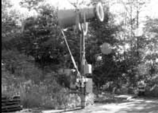
Hedco tower mounted snowmaker

The leisure and recreation segment of business accounted for 1% of the Company's revenues in fiscal 2003, 5% of the Company's revenues in fiscal year 2002 and 1% of the Company's revenues in fiscal 2001.